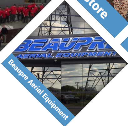
Beaupre Aerial Equipment