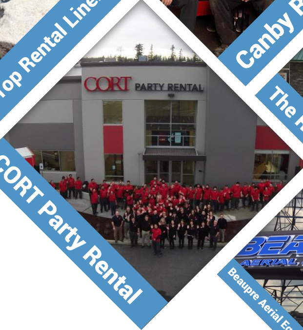
CORT Party Rental