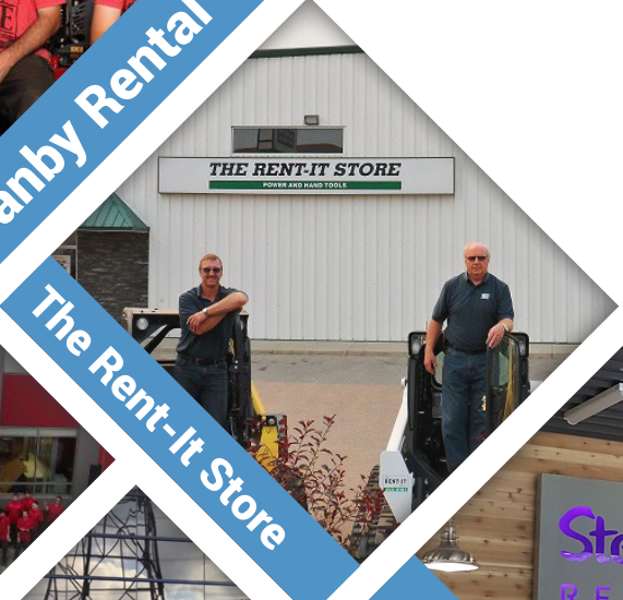
The Rent-It Store