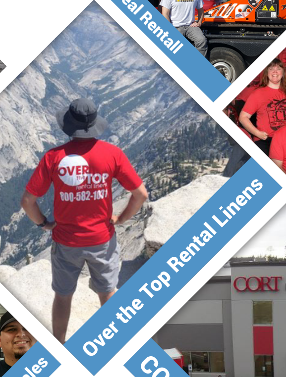
Over the Top Rental Linens