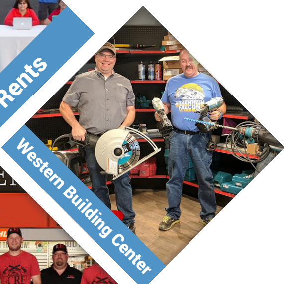
Western Building Center