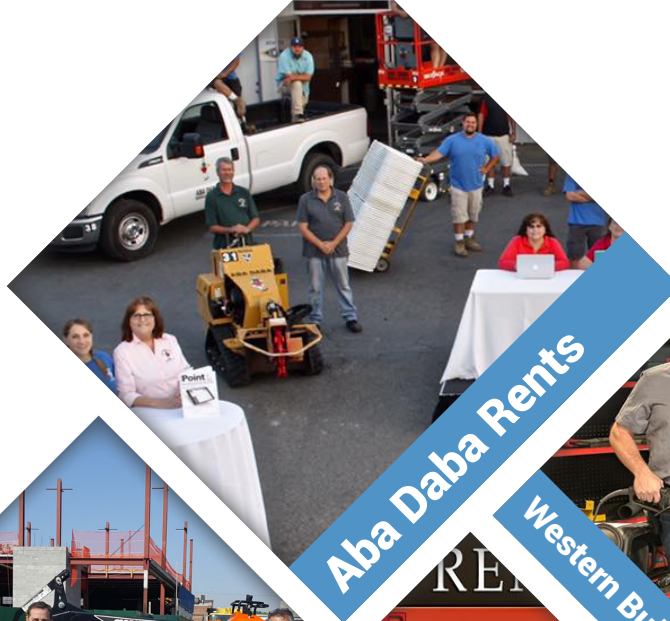
Aba Daba Rents